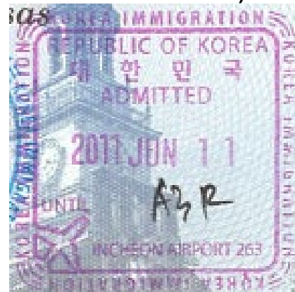
Note the "Until" date reflects "A3", which is used when an A-3 Visa has been previously issued in the passport.